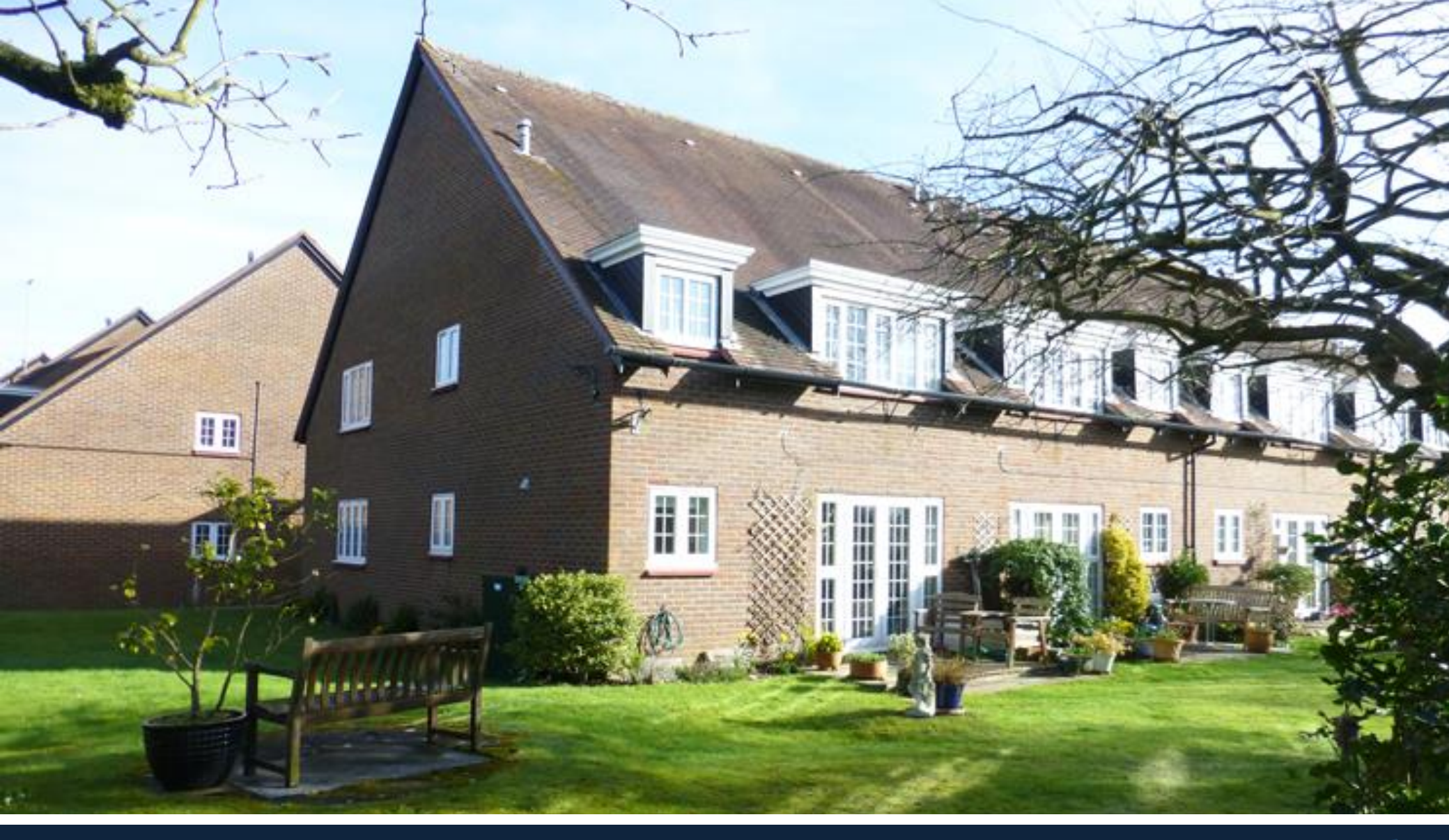
32 Barnside Court – Barn Close – Handside Lane – Welwyn Garden City – Hertfordshire – AL8 6TL A one-bedroom ground floor apartment in a popular retirement development close to shops